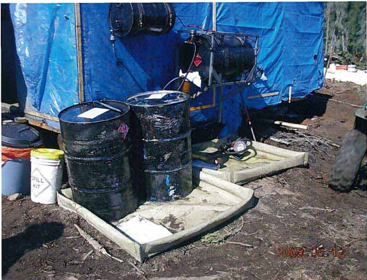
MV2007C0039 - Avalon Ventures Ltd. Secondary containment at the active drill.