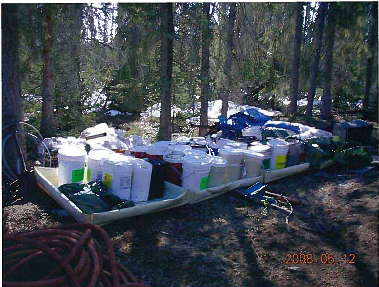
MV2007C0039 - Avalon Ventures Ltd. Drilling supplies are stored in insta berms as well.