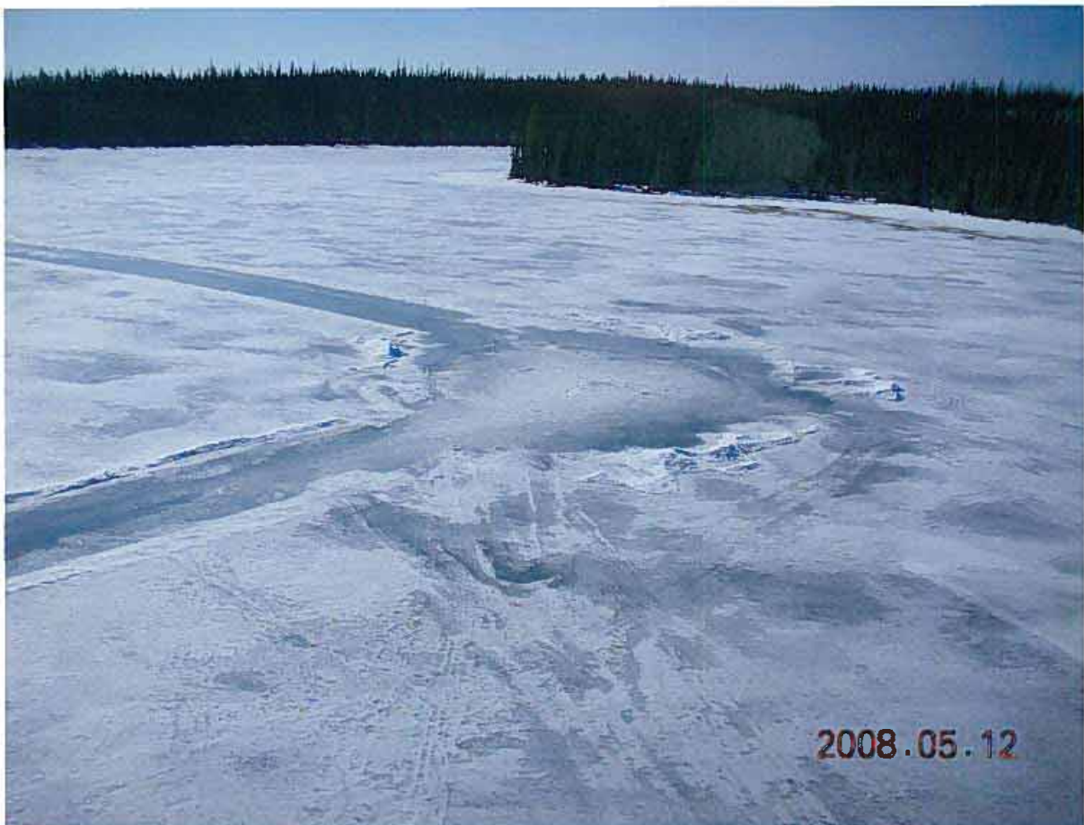
MV2007C0039 - Avalon Ventures Ltd. Completed drill site on Thor lake.