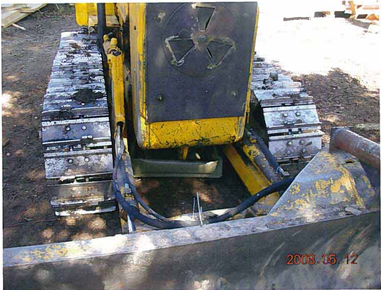
MV2007C0039 - Avalon Ventures Ltd. Drip tray has been placed under the dozer.