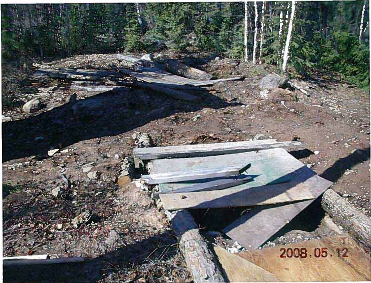
MV2007C0039 - Avalon Ventures Ltd. Old sumps that require backfilling.