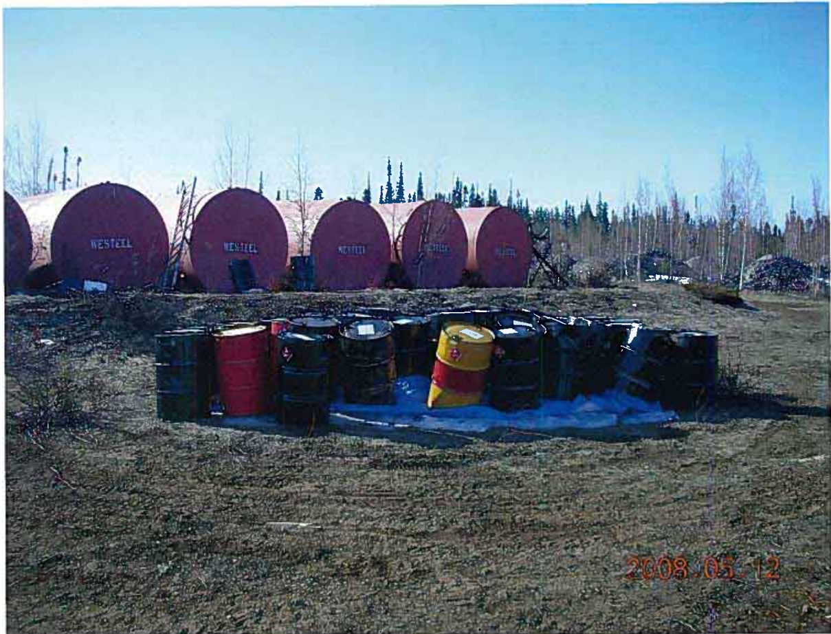
MV2007C0039 - Avalon Ventures Ltd. Old fuel from the tanks in the background are being pumped into drums and utilized in the tent stoves.