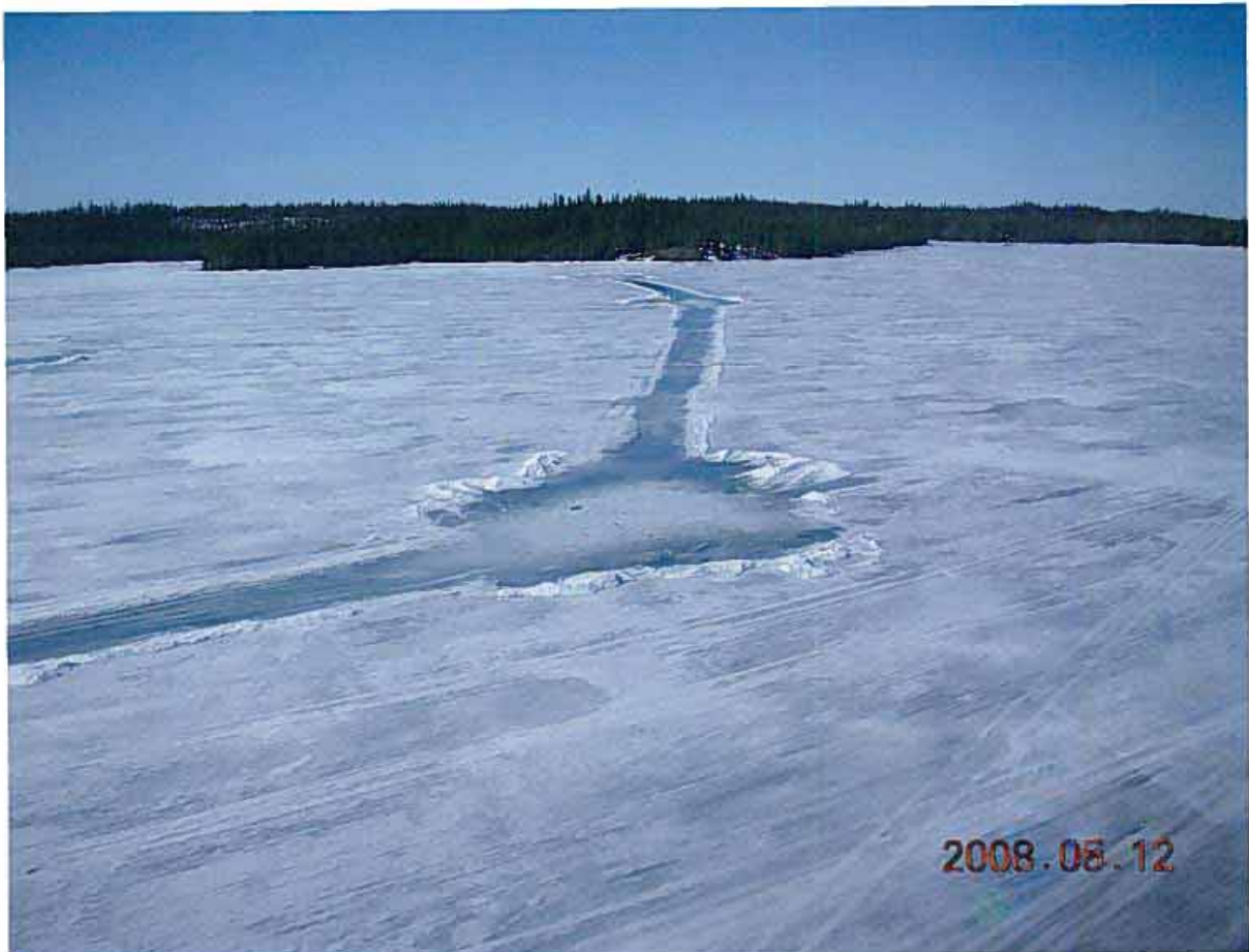
MV2007C0039 - Avalon Ventures Ltd. Completed drill site on Thor lake.