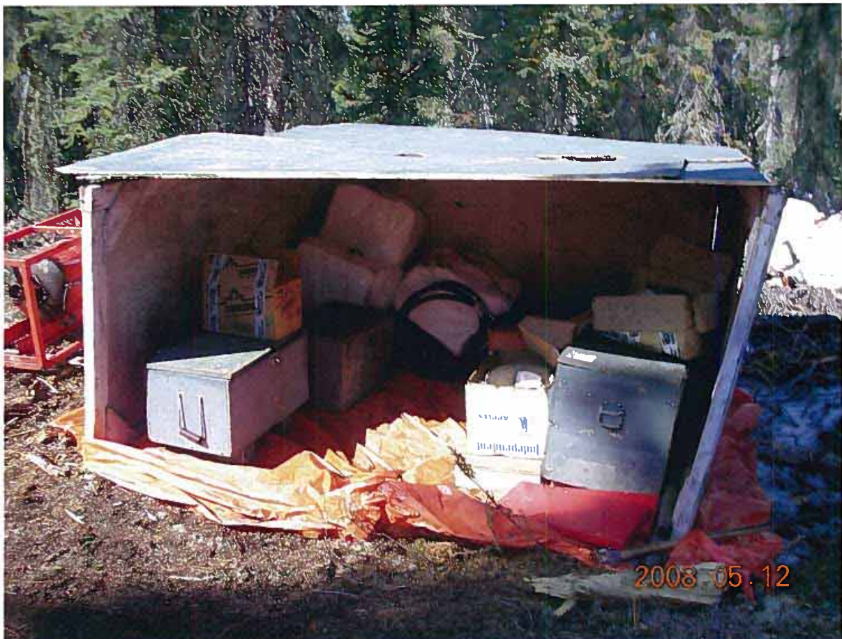
MV2007C0039 - Avalon Ventures Ltd. Bundles of absorbent pads readily available at the fuel cache.