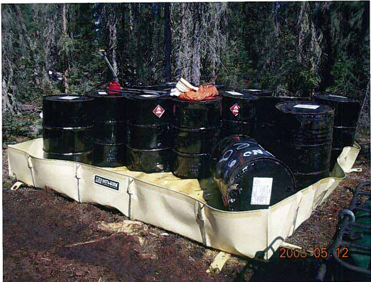
MV2007C0039 - Avalon Ventures Ltd. All fuel caches on site have been placed inside insta-berms.