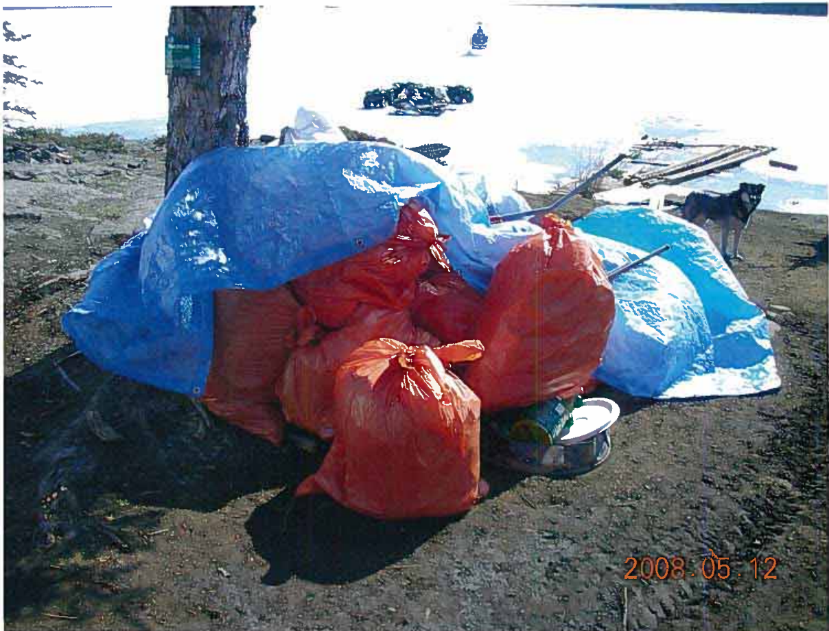
MV2007C0039 - Avalon Ventures Ltd. Garbage on site waiting backhaul. Permittee must come up with a better storage practice for garbage.