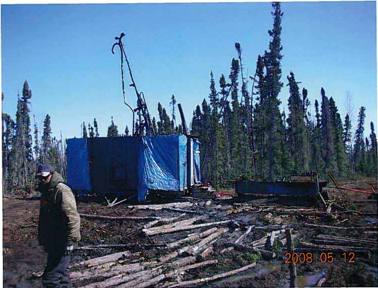
MV2007C0039 - Avalon Ventures Ltd. Peak's drill on a land based target.