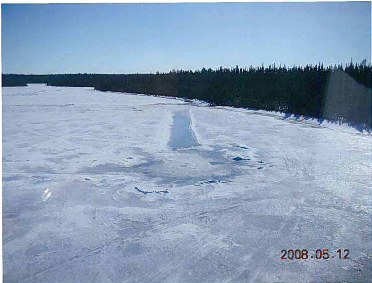
MV2007C0039 - Avalon Ventures Ltd. Completed drill site on Thor lake.